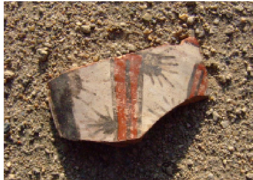
Top: shards of Nazca pottery litter the ground, often decorated with cacti fruits