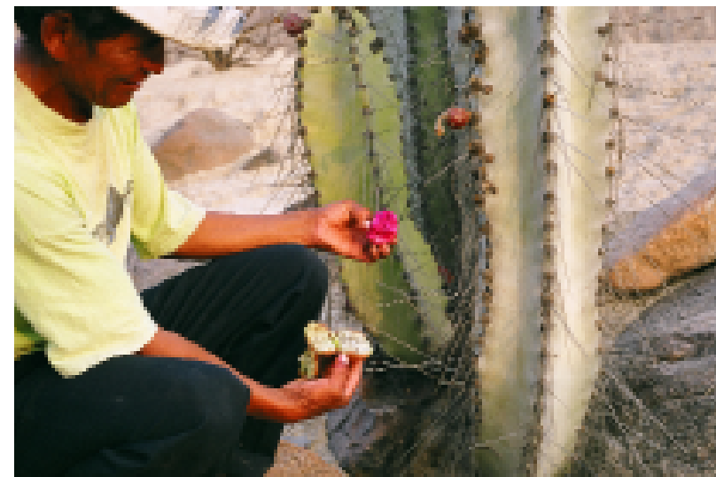
Above: only when it's swollen with water does Neoraimondia arequipensis bear fruit