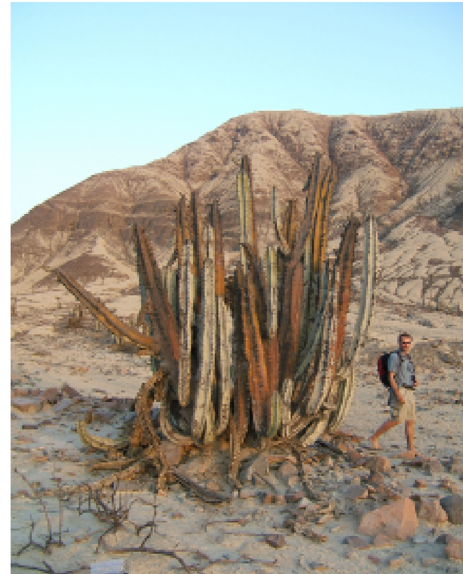
Right: Corryocactus brachypectalus guard the source of the flood water, high in the Andes