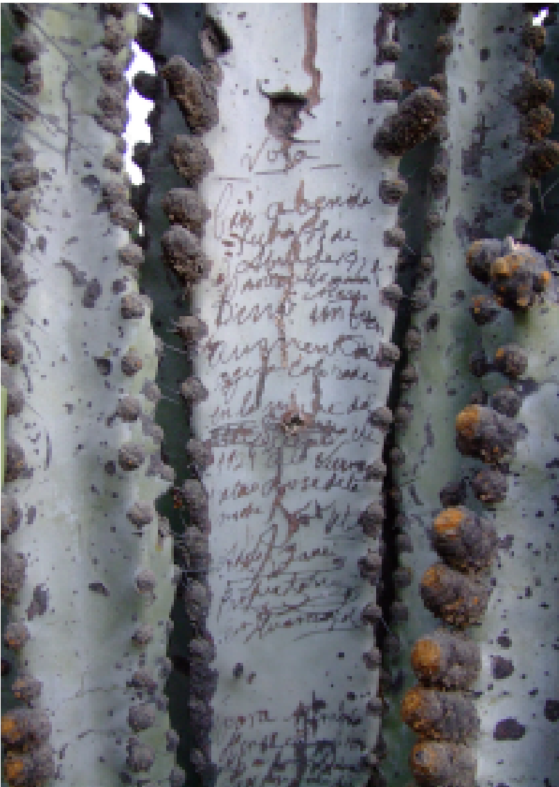
Many scripts refer to water, this one telling of the arrival of 'a good increase of brown water'